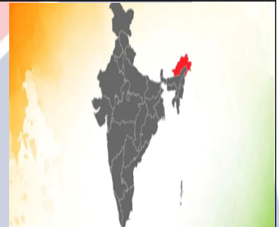
Arunachal Pradesh Foundation Day

Foundation Day of Mizoram and Arunachal Pradesh was celebrated on 20 February. Mizoram became the 23rd state of India on 20 February 1987, its capital is Aizawl, and the main languages are Mizo and English. Arunachal Pradesh, formerly called NEFA, became the 24th state of India on this day in 1987, its capital is Itanagar and the state language is English.